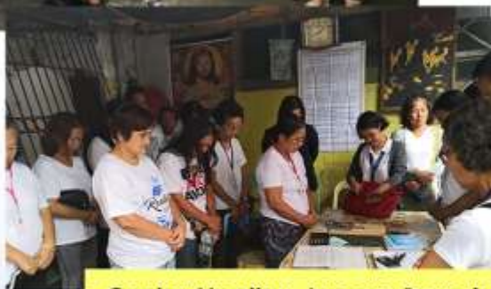
Center Meeting, Lucena Branch, Quezon