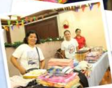
Paskuhan sa TSPI