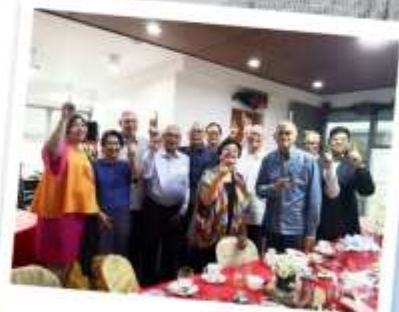
Fellowship with the Founder