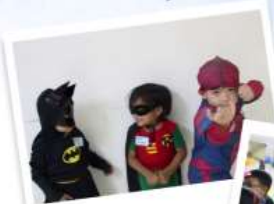
Treat and Costume Party for Kids

The party ended with everyone gathering at the TSPI lobby for the lighting of the Christmas Tree, with the Board of Trustees, the Executive Director and Senior Management present. The brief ceremony was filled with Christmas songs and praises for the coming of the Messiah.