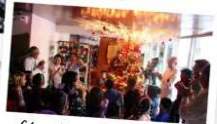
Christmas Tree Lighting