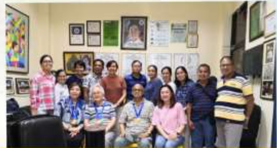
Mayor's Office Courtesy Visit with Pres. R. Cristobal, Lucban, Quezon