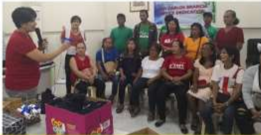
TSPI MBAI at San Carlos Branch, Pangasinan