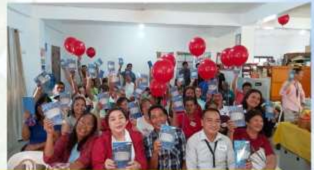
Malasiqui Branch Dedication, Pangasinan