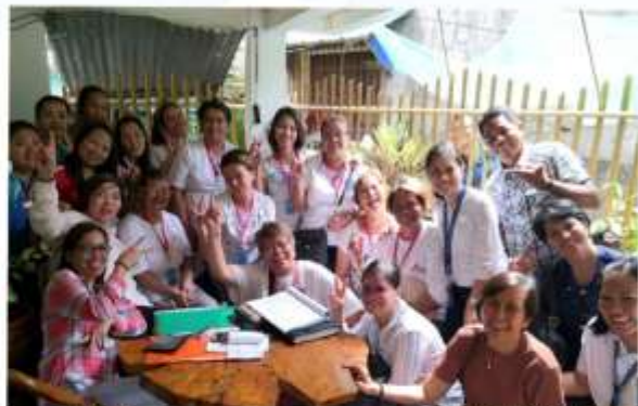
Center Meeting, Tayabas Branch, Quezon

The WoW Trips enabled BOT and management to shepherd the flock, give a fresh outlook and inspiration towards achieving the mission together.